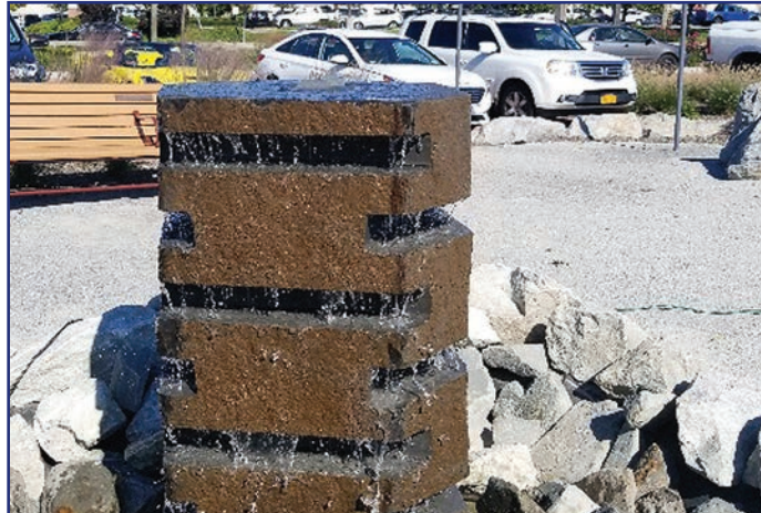
New Zen Basalt Fountain installed by Bucky Demelas & Sons.