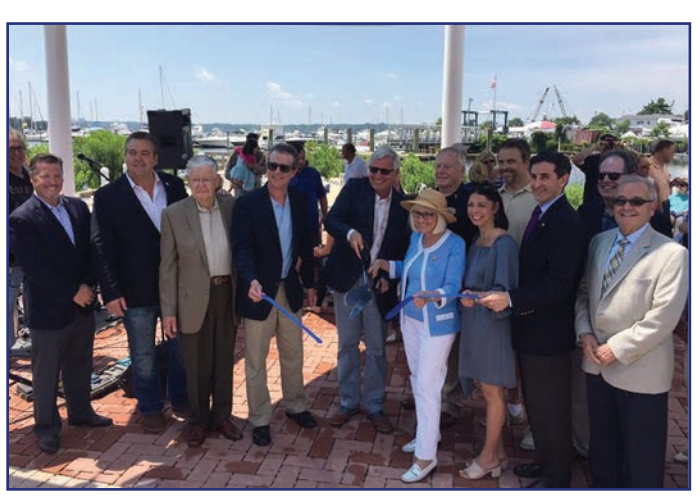
Ribbon Cutting with Village and Town Officials.