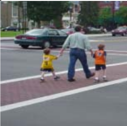
Red-brick patterned crosswalks will provide for safer crossing.

As part of our effort to make the Village safer while beautifying it, almost two years ago the Village received a $280,200 grant to initiate the traffic calming of Shore Road. We raised an additional $59,000 to bring the project up to $340,000. Final construction plans are finally approved and the project is currently out to bid. We expect to begin construction this fall.