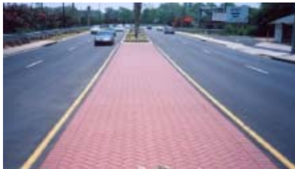
Red brick patterned medians will slow the flow of traffic and add to the character of our Village.

The Phase 2 plan will address the area north of Phase 1 and consists of adding wide, visible, crosswalks at many locations across Shore Road. It will provide for the construction of new handicap ramps at many of these crosswalk locations and the replacement of old crossing signals with the new state of the art countdown signals with audible detection to provide for the hearing impaired. Let's keep our fingers crossed.