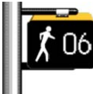
Crosswalk countdown signals with audible detection.

Road crosswalks will be 10 feet wide, and the crosswalks at Mill Pond Road and Harbor Road will be eight feet wide. We believe these enhancements will allow