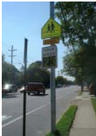
Slow down, you move too fast! These new speed monitoring devices will let you know.