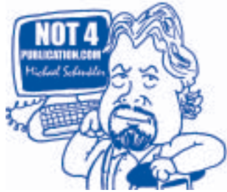
From my weekly newspaper column, "Not4Publication"