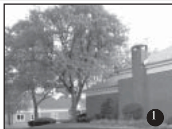
Village Hall (adjoining the Roslyn Saving Bank).