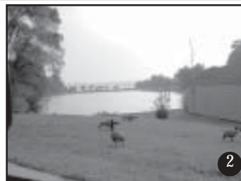
Mill Pond (from Harbor Rd.).