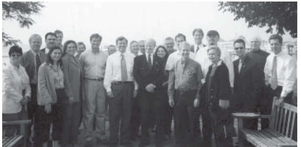
The Walkable Communities Workshop which was instrumental in the Port North Local Safe Street and Traffic Calming Grant.

This grant opportunity is benefited by the Walkable Communities Workshop