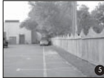
Behind Soundview Shopping (by Waterview).