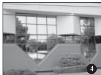
L.I. Alzheimers Assoc. building (formerly Hyde Ins.).