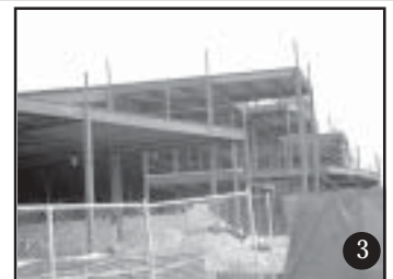
Stop and Shop (under construction).