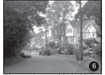
Pleasant Avenue (it's the biggest hill in Village).